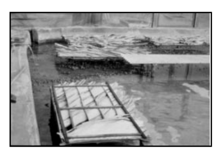
Concrete pen with 2,000, 1-month old frogs.

The size and shape of grow-out pens can vary greatly, but all rely on large exposed "islands" surrounded by or adjacent to flowing